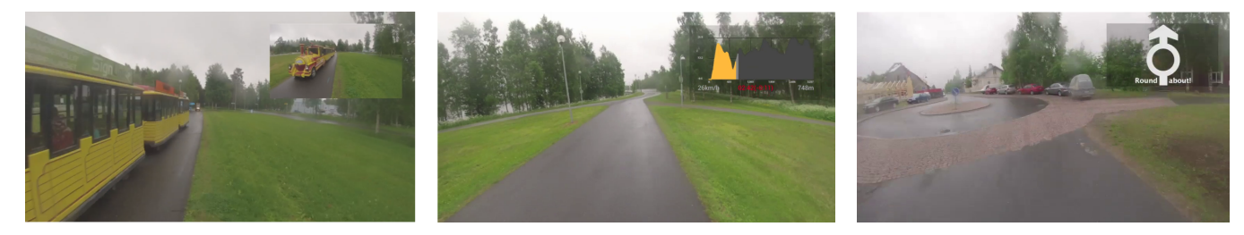
Figure 1: User interface mockups. Left: The biker records an interesting section of the ride; Middle: Track overview while the biker is behind the time plan; Right: Location-triggered notification (please zoom in for viewing)

Tomer Weller<sup>‡</sup> Shenkar, Israel