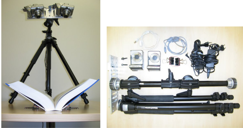
Figure 1. A prototype scanning rig, consisting of standard tripod hardware and consumer digital cameras. The rig is portable and can be operated anywhere using a laptop computer.

resolution digital cameras. The project will deliver an out-of-the-box solution that allows local staff with modest training to easily capture their material and convert it to archive quality content suitable for deposition in online archives. The solution will deal with bound material that must be treated gently (and also, of course, single sheet material), and will trim the image down to the page boundaries and remove discolorations and other visual defects so as to deliver page images comparable to those from a flat bed scanner. Our proposed solution will accomplish the following: