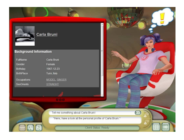
Figure 1: Gossip Galore responding to "Tell me something about Carla Bruni!"

This paper is organized as follows. Section 2 gives an overview of the system architecture and