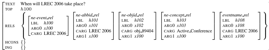
Figure 4: RMRS generated by SProUT with fine-grained named entity information.