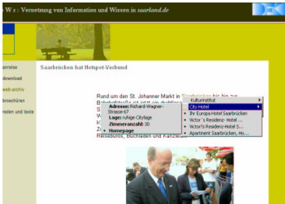
Figure 2: Detailed information on hotels from the Knowledge Base