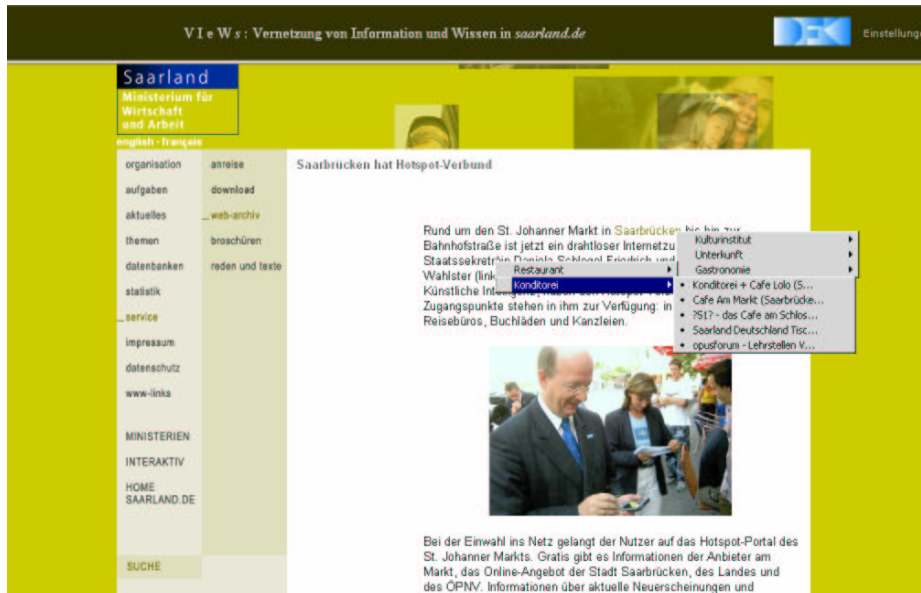
Figure 1: VIEWS with the Tourism Ontology