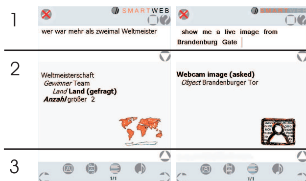
Figure 1: In (1) we display the output of the automatic speech recogniser, (2) shows the corresponding multimodal semantic paraphrase. The query paraphrase can also be listened to by on ear audio output. While audio repetition plays, barge-in is possible which leads to correction modes for single words or the complete query.

Interesting decisions in dialogue management are concerned with these system initiatives.