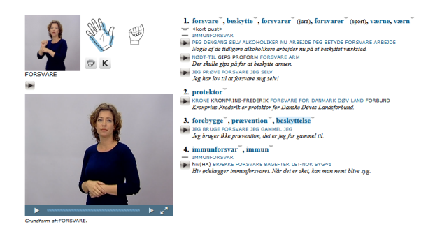
Figure 2: The Danish sign associated with the OMW ID "00817680-n", corresponding to the (highlighted) lemma "beskyttelse", here as one possible lexical realisation of the Danish gloss "FORSVARE" ( defend )

tionary sources are encoded in a database, from which we got the TSV export. In this export, looking at the entry corresponding to the page displayed in Figure 2, we first have the sign_gloss ("FORSVARE"), written in capital letters, as this is a good practice in SL datasets for indicating that we are dealing with a very generic concept or term for annotating a sign. This gloss is related to the word/lemma "beskyttelse", marked as a noun, with its English translation ("protection").