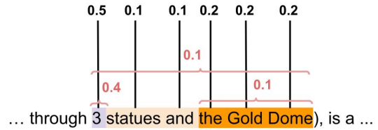
Figure 2: Example on how token scores are obtained from probabilities of overlapping phrases 3, the Gold Dome and 3 statues and the Gold Dome