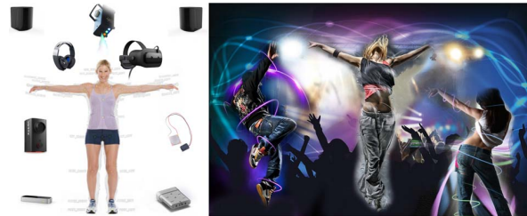
Figure 1: Imagine you feel lonely at home and wish to dance with somebody. You invite both your real friends and artificial intelligence (AI)-driven characters for a virtual house party in your living room to dance together. You can feel their touch and dancing bodies next to you and you are all enjoying this spontaneous party. You feel connected to the others and not lonely anymore. Augmented remote dance aims to overcome current challenges of learning practices hitherto restricted to the same physical space.

dren and is attested universally across world cultures [25]. Dance uniquely combines thinking, feeling, sensing, and doing. It has strong effects on physiological and psychological well-being, combining the benefits of physical exercise with heightened sensory awareness, cognitive function, creativity, inter-personal contact and emotional expression [11, 25]. This is why in CAROUSEL+ we have chosen dance as vehicle to implement our vision.