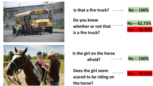
Figure 1: Example from VQA-Rephrasings dataset (Shah et al., 2019). The answers are obtained using Pythia (Jiang et al., 2018) where green text refers to correct answer and red text refers to wrong answer.

by introducing semantically rich visual features (Anderson et al., 2018), efficient attention schemes (Lu et al., 2016; Yang et al., 2016), and advance multimodal fusion techniques (Fukui et al., 2016; Yu et al., 2017).