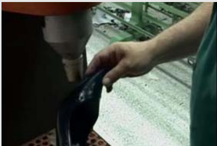
Manual final operation to iron the leather without last.