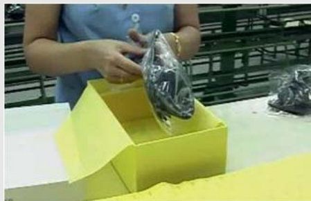
Manual packaging of the shoes.