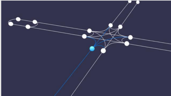
Graph-based navigation planning for multi-agent intralogistics

Flexible high-lift wing assembly with a digital and efficient high-rate production in the industry 4.0