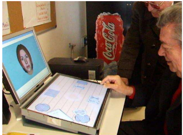
Figure 1. The BriscolaTable in the study setting.