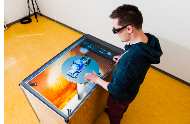
Figure 2: Screenshot of the implemented prototype. The widgets are displayed on the right.

The 62cm × 112cm multi-touch enabled active stereoscopic tabletop system uses rear diffuse illumination [8] for the detection of touch points. Therefore, six high-power infrared (IR) LEDs illuminate the screen from behind. When an object, such as a finger or palm, comes in contact with the diffuse surface it reflects the IR light, which is then sensed by a camera. The setup uses a PointGrey Dragonfly2 camera with a resolution of 1024 × 768 pixels and a wide-angle lens with a matching IR band-pass filter at 30 frames per second. We use a modified version of the NUI Group's CCV software for detection of touch gestures with a Mac Mini server. Our setup uses a matte diffusing screen with a gain of 1.6 for stereoscopic back projection. For stereoscopic display on the back projection screen we use an Optoma GT720 projector with a wide-angle lens and a resolution of 1280 × 720 pixels. The beamer supports an active DLP-based shutter at 60Hz per eye. For view-dependent rendering we attached wireless markers to the shutter glasses and track them with a WorldViz PPT X4 optical tracking system.